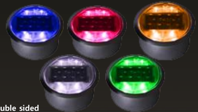
MS – 6040 Double sided